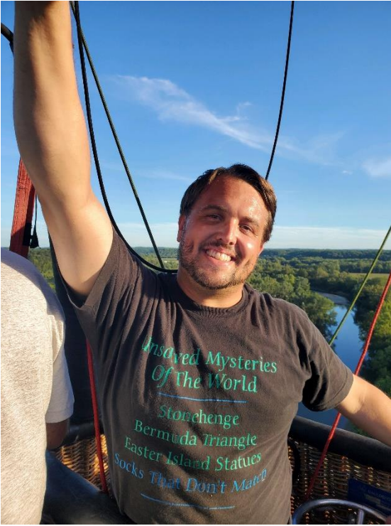
Beloved Son, Brother, and Friend